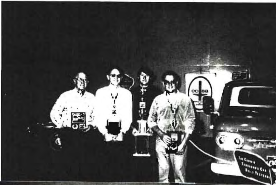
2nd Place - Pickups