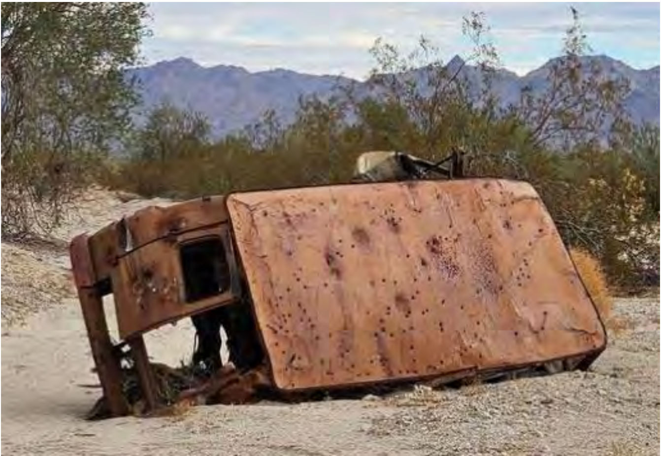
Ran when parked