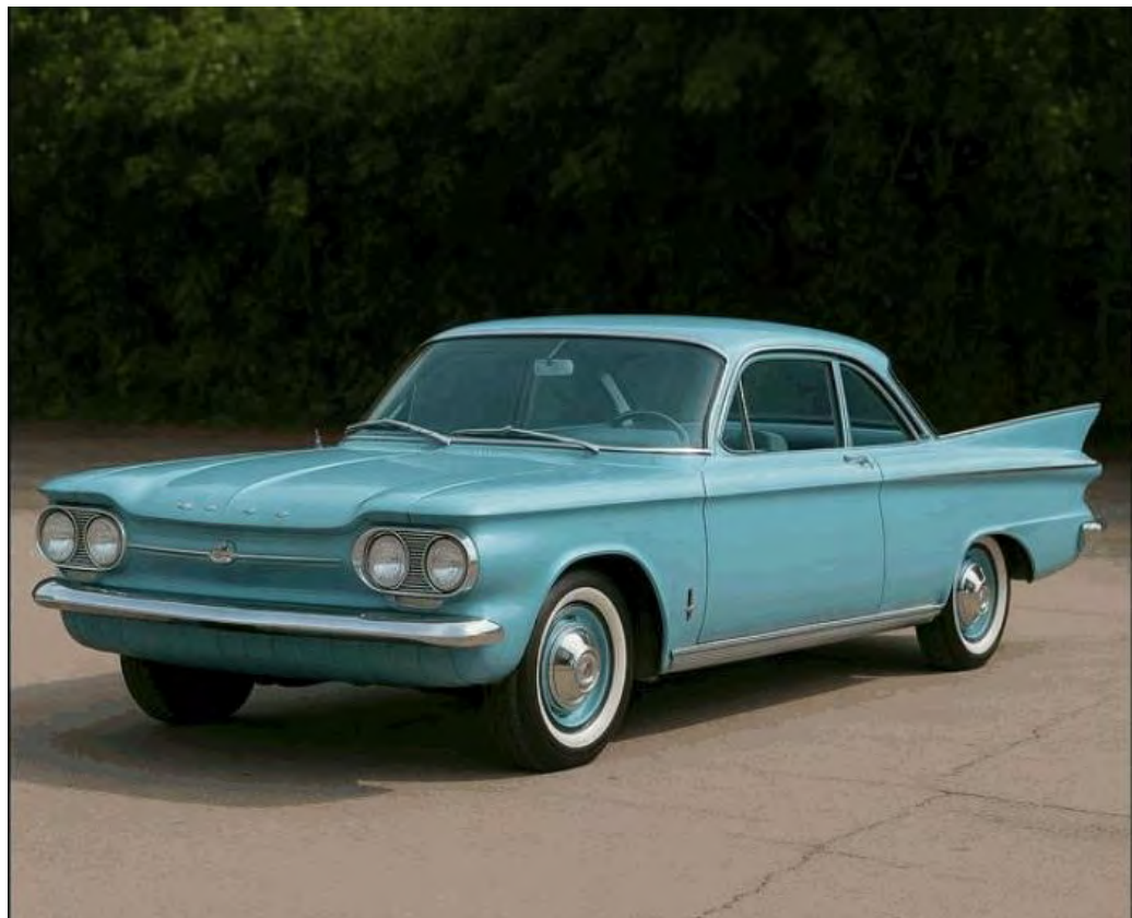
The 1957 Corvair