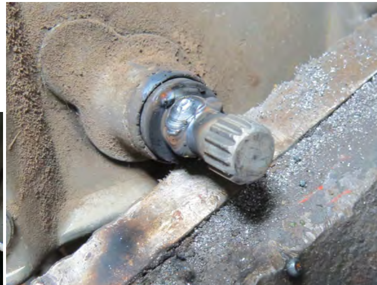
The new spline was clamped in place (left) and welded (above). Even though the weld is a bit large, there was no need to file it down since there was still plenty of clearance for the door handle to slid all the way on.