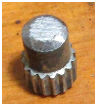
The new spline was beveled for better weld contact.