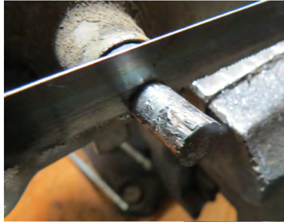
The old spline was removed from the door latch assembly with a hack saw (left) as well as the new spline from the window regulator (below).

The new spline was then clamped to the door latch and welded in place. Since there was plenty of room for the door handle to go on all the way on without interfering the weld, there was no need to clean up the bumps of the weld.