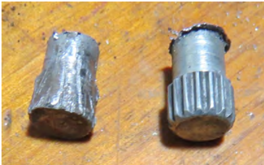
Both splines were cut off at the step since from the step out they were the same length