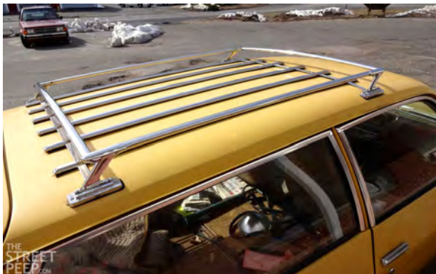
In the late 60s and early 70s Chevrolet offered luggage racks for several models including the Vega Kammbach (left) and the Chevy II station wagon. These racks work very nicely on the Corvair 95s (right).