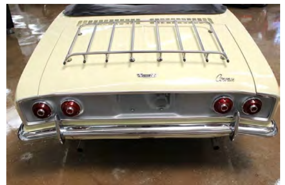
Many have added after-market luggage racks to their cars. Above right is an example of a rack mounted on an early coupe and another, shown above, on a late model coupe.