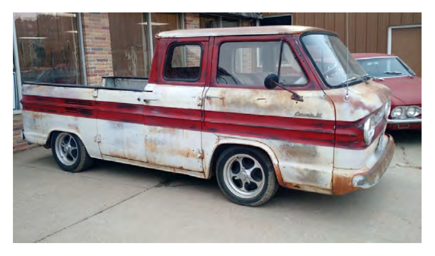
Hare's a unique way to get an extended cab pickup truck. Simply take a Greenbrier and make one yourself! Looks easy enough......