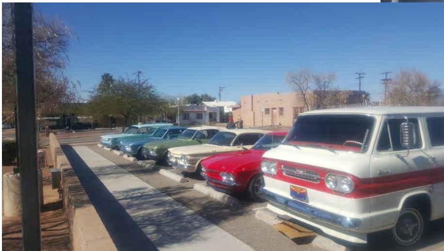
There were no less than six Corvairs in attendance on the tour, every one a beautiful site!