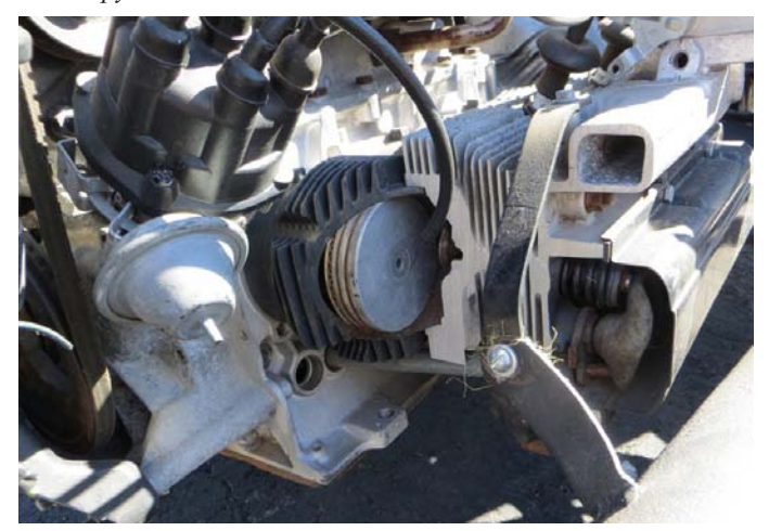
On the cut-in-half 4-door, even one of the cylinder and the head had a little cut-a-way action going on.