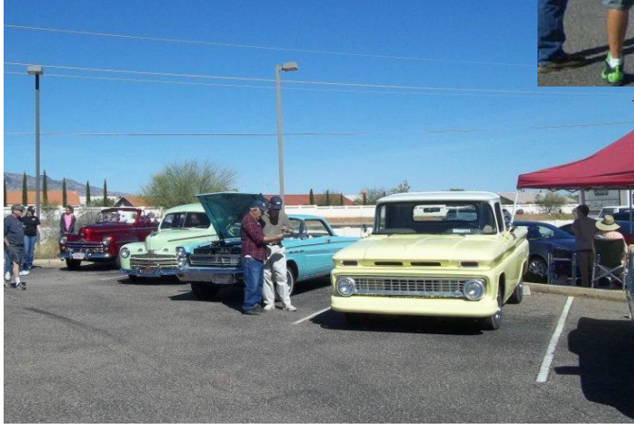
Lots of great cars attended the Show this year.