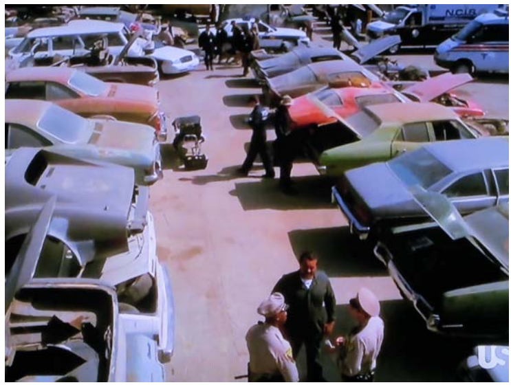
In this shot you can see Ducky and Palmer doing their investigation in the trunk of the green Nova. Across the isle are several early and late model Corvairs.

In one NCIS episode, a body is found in the trunk of a car in a local wrecking yard. It would be interesting to find the yard. There appears to be a plethora of great cars there.