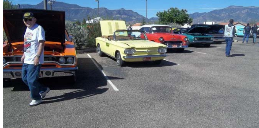
Tweetie and Steve's '55 Bel Air share adjoining spaces at the Spring Show in Sierra Vista.