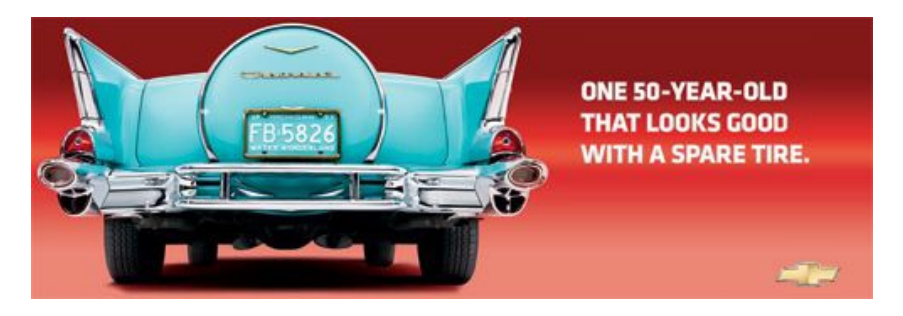
Chevy Showdown · Saturday, April 28