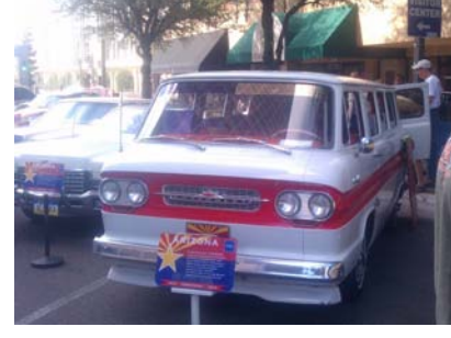
Ron Bloom's 1962 Greenbrier (above) and a 1942 Ford Jeep (below)

1992 Corvette: $37,644 2002 PT Cruiser: $17,075 2012 Mustang: $36,285