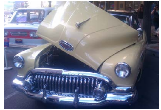
This yellow Buick was the pick for 1952.