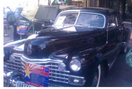
A Cadillac was one of two cars to represent 1942

There were 9,540 Model 30 Packards (above) built between 1906 and 1912. Compare that with the 1,301,067 Ford Model Ts (right) manufactured in 1922 alone. Both cars were built in Detroit.