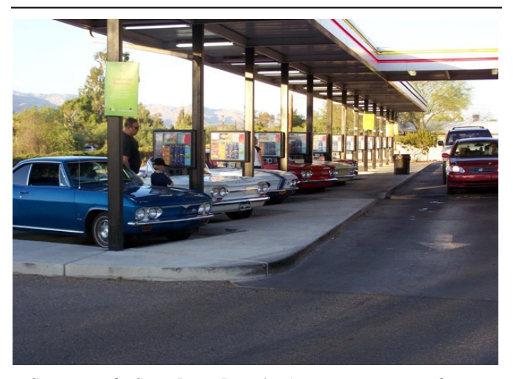
Corvairs at the Sonic Drive-In on 1st Avenue on a cruise night in July 2007.