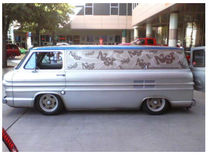
at the SEMA Show in Las Vagas recently.

So as you can see, the poor Corvair engine doesn't stand a chance, the next time you have your engine apart, be very careful and particular about how it goes back together remembering that cleanliness is next to Godliness.