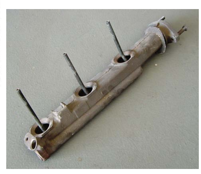
Typical A.I.R. exhaust manifold