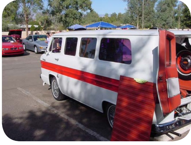
Cops and Rodders