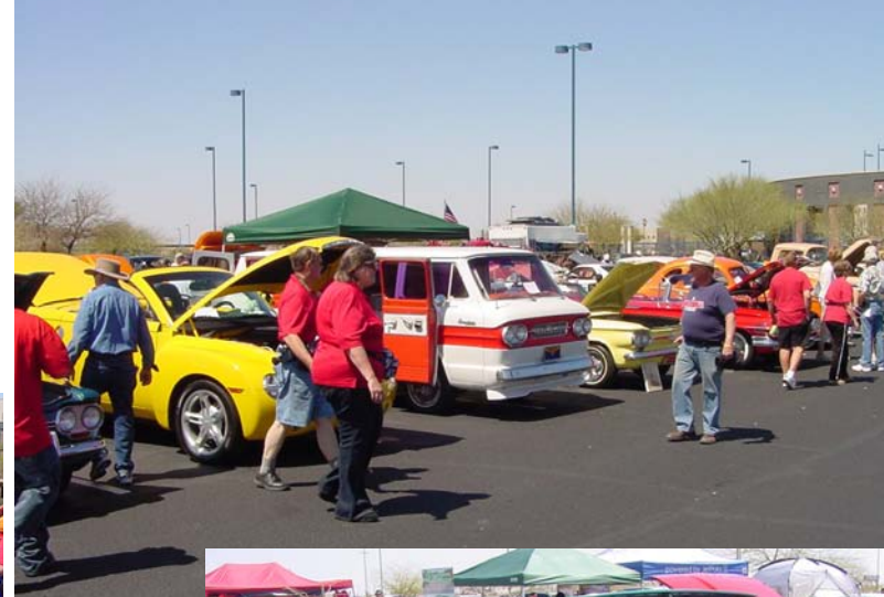
A rear view of Allen's '64 (above)