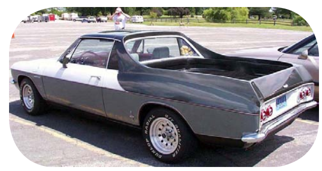
The El Cormino