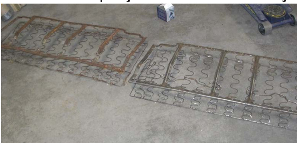
Original rust seat frame on the left and modified seat frame on the right.