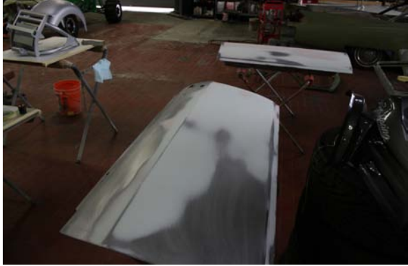
Doors almost ready for paint