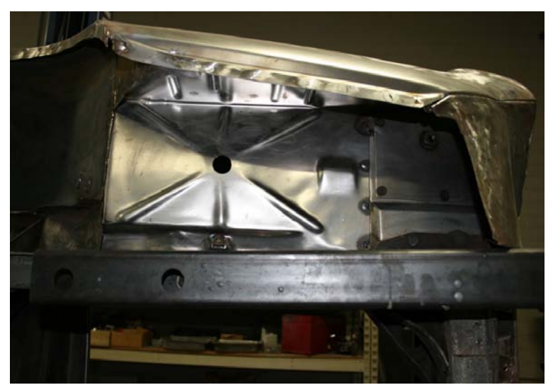
New sheet metal parts welded in place