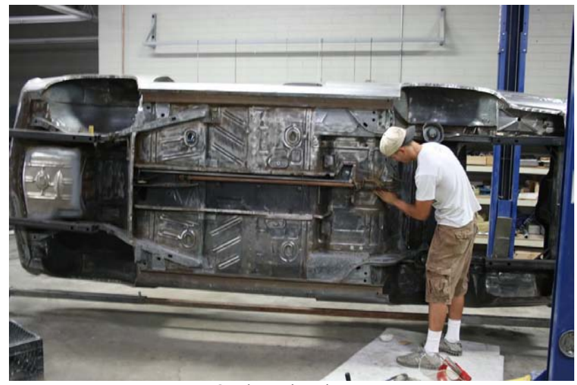
On the rotisserie