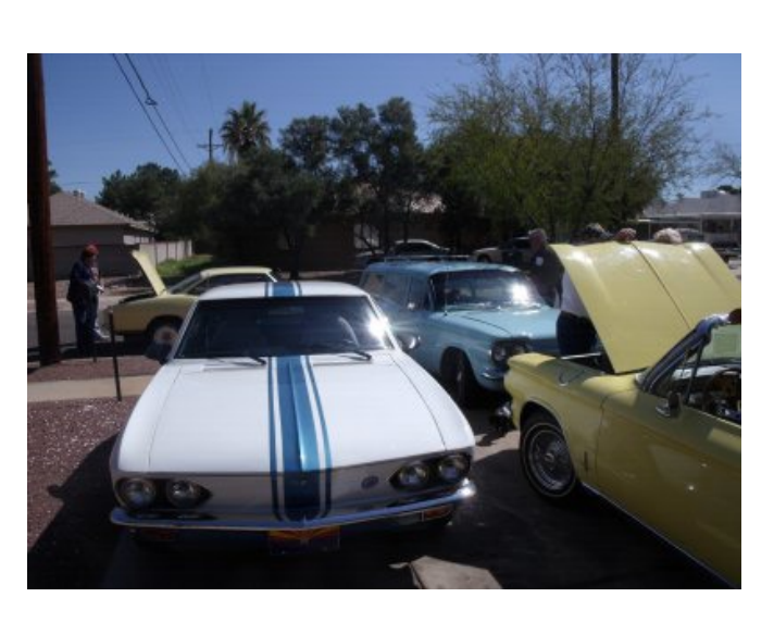
Van's Stinger with Bill's Lakewood in the background