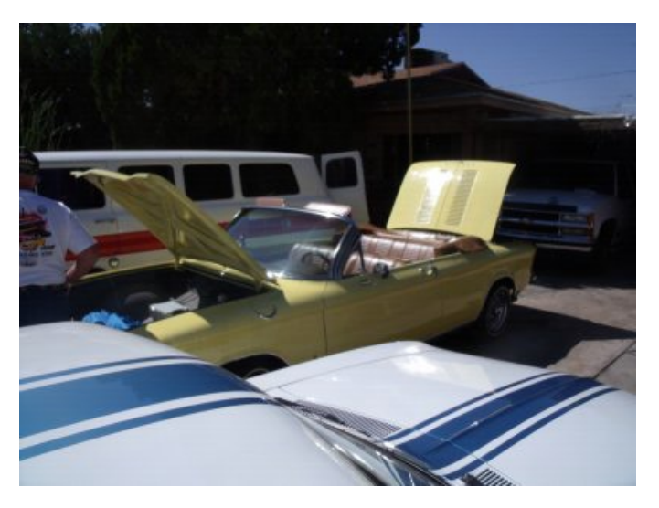
Ken's Tweety shows all.