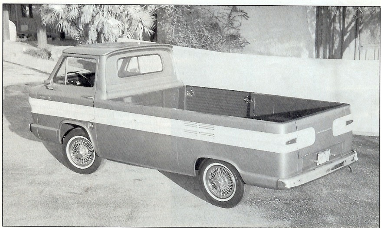
Rampside pickups were built between 1961 and '64, with total production reaching 17,786. Production went down steadily each year with sales totaling 10,787 in 1961 alone. This particular rampside, owned by Francis Lux of Ladson, South Carolina, is dressed a bit more formally than most rampsides; the optional wire wheelcovers and twin chrome mirrors don't exactly mesh with a utilitarian ideal.

As mentioned, when first offered Rampsides were reasonably popular. With a base price of $2133, the innovative pickups were chosen by 10,787 truck buyers in 1961. From there, though, it was all downhill; '62 sales fell to 4102, '63 to 2046, '64 to 851. And that was it. Like the Corvair itself would later do, the Rampside pickup just faded away. With or without the ramp, there simply wasn't a market base strong enough to support light-duty utility vehicles in the early '60s. The idea wasn't that bad, it just didn't work or was it that it just didn't work hard enough?