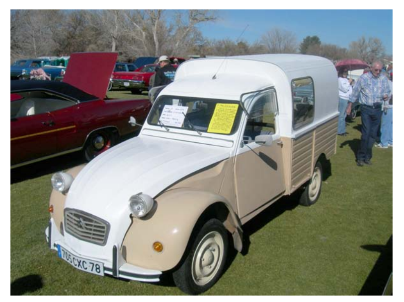
Most Unique: 1972 2CV Citroen owned by Ken Henry. 60 miles per gallon is possible with this air-cooled opposed 2-cyl machine.

Below: "For Sale" by Tom and Sue Dougan of Green Valley, AZ. Sign states a '66 coupe with a 110hp engine. Price: $6500. Phone: 520-398-9324.