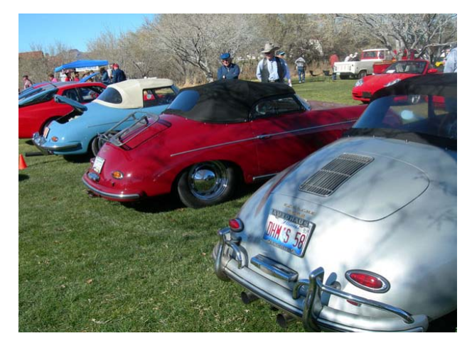
Three early Porsche speedsters (pre As & 356s) at Tubac Car Show in January.