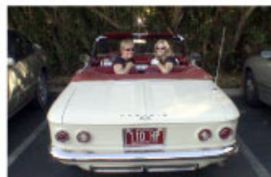
My '64 convertible at a recent high school reunion in Tucson displaying some very fine... lines.