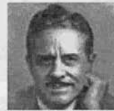
Raymond Loewy 1893-1986

Shell's revenues of $306.73 billion (2005) made it the third-largest corporation in the world by turnover in 2005 and its profits of $25 billion made it the world's second most profitable business in terms of gross profits after ExxonMobil. The Forbes Global 2000 for 2006 ranks it as the seventh largest company in the world. Shell operates in over 140 countries worldwide, and its largest revenues come from the United States.