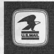
A few more of Loewy's famous designs.