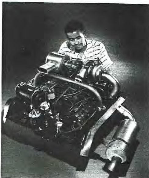
1962 Corvair Turbo-Charged 150 H.P. Engine