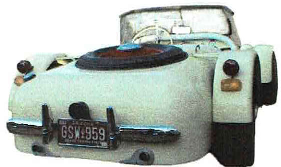
Pictured clockwise from top left: 1) The Mt. Lemmon construction crew: Patrick, Cassidy, and Colton. 2) A shiny row of early models under the pine trees on Mt. Lemmon. 3) Patrick engineers an addition to the structure. 4) Ask Dave Baker about this outstanding classic hotrod. 5) Rose Canyon Lake parking lot. 6) Chris' 110HP at rest.