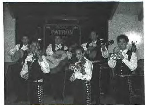
Estrellas de America mariachi band plays on Friday and Saturday nights 6:30pm - 8:30pm. at Micha's del Norte.

Micha's del Norte is owned and operated by the Mariscal, Sharpe, and Granillo Families. To view the menu on-line go to http://www.michasdelnorte.com/MENU.html